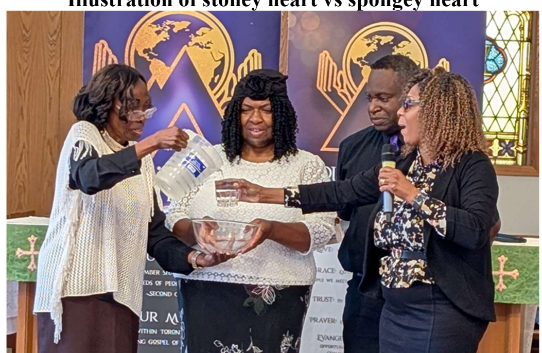
Illustration of stoney heart vs spongey heart