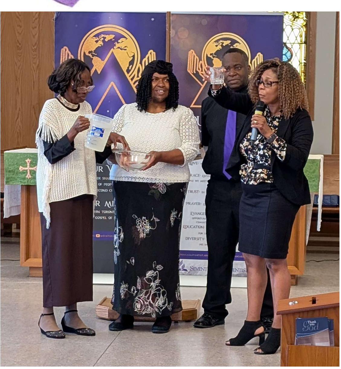
Main Message: We need to be filled with the Holy Spirit till our cup is full and running over.

A soft heart will be like a sponge that can soak up the Spirit, Who will transform our ways.